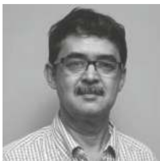
SUDIPTA BASU SOUND RECORDING & DESIGN